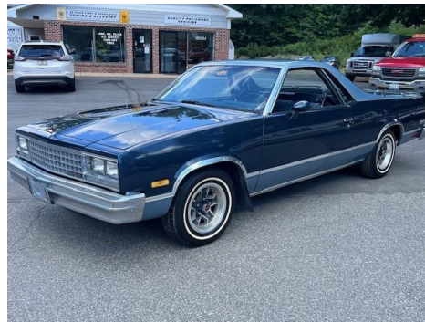
1985 Chevrolet El Camino – High Bid $8,500 – Sold

This past weekend was the Owls Head Transportation Museum's 46 th Annual New England Auto Auction. Although I was not in attendance, I was able to source the following information from the Owls Head Transportation Museum and Proxibid websites. This first page, except the 29 Ford Model A pickup, are Friday results from the Proxibid website ( Owls Head Transportation Museum Auction Catalog - 2024 New England Auto Auction - DAY 1 Online Auctions | Proxibid ). The rest are Saturday's lots from the Proxibid website ( Owls Head Transportation Museum Auction Catalog - 2024 New England Auto Auction - DAY 2 Online Auctions | Proxibid ). Prices are without bidders premium. (* from Proxibid Live webpage). Some trucks offered are not shown.