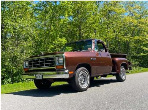
1982 Dodge D-150 - High Bid $10,000* - Passed