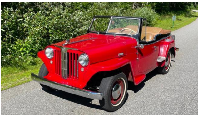
1949 Willys Jeepster – High Bid $15,000 – Sold