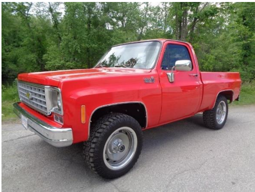
1976 Chevrolet K-10 4x4 – High Bid $15,250* - Passed