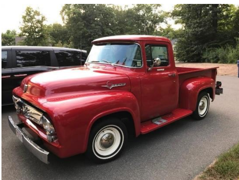
1956 Ford F150 – High Bid $25,000 – Sold