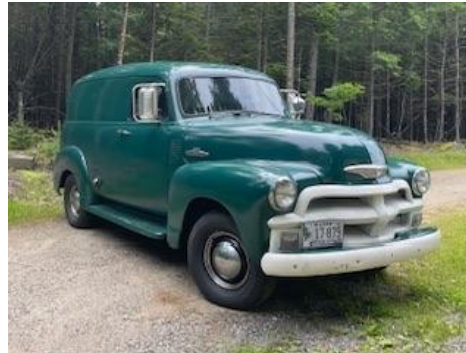
1955 Chevrolet Panel Truck – High Bid - $8,500 – Sold