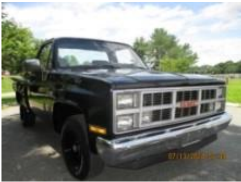
1984 GMC Sierra 1500 – High Bid $4,000*