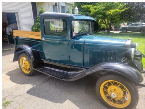
1929 Model A Pickup – High Bid $7,500* – Passed