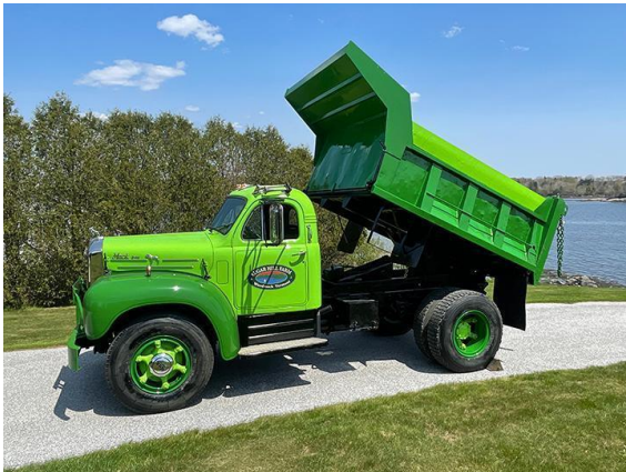
1959 Mack B42 Dump Truck – High Bid $12,000 – Sold