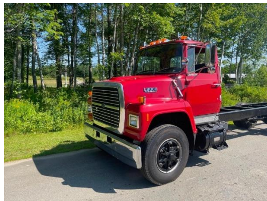
1989 Ford LN8000 – High Bid $11,500 - Sold