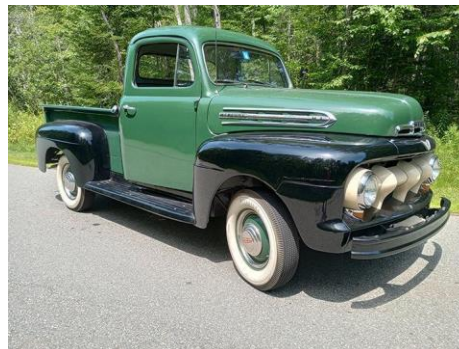
1951 Mercury M-1 – High Bid $23,000 – Sold