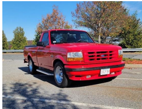
1993 Ford F-150 Lightning – High Bid $21,000 – Sold