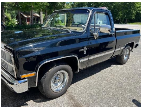
1982 Chevrolet C-10 – High Bid $7,250* - Passed