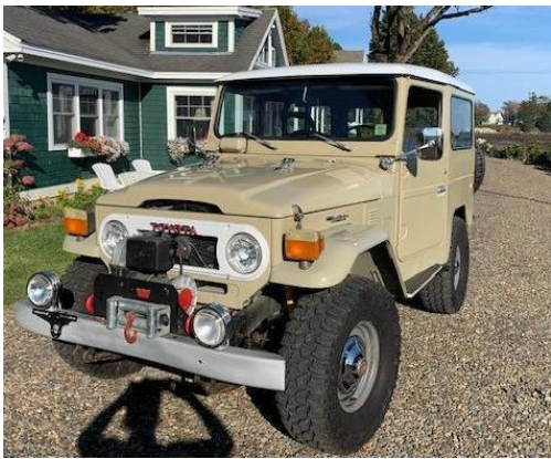
1975 Toyota Land Cruiser – High Bid $30,000 – Sold