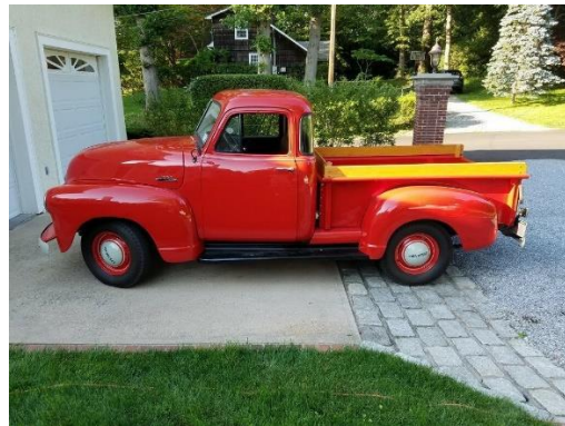
1953 Chevrolet 3100 – High Bid $9,000 - Passed