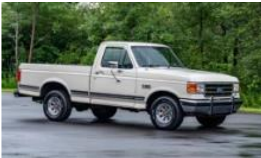
1990 Ford F-150 – High Bid $14,500 - Sold