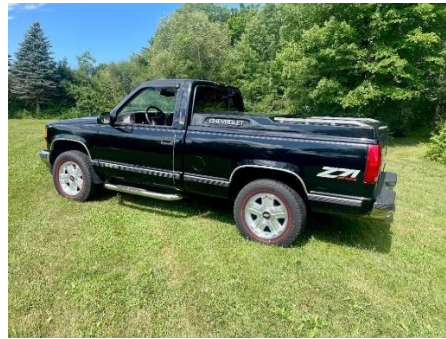
1998 Chevrolet Z71 High Bid $20,00 – Sold