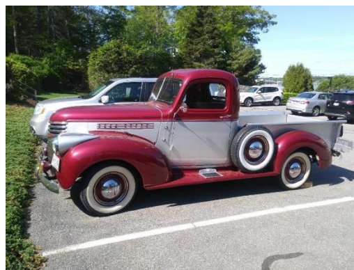
1941 Chevrolet 3100 – High Bid $17,000 – Sold