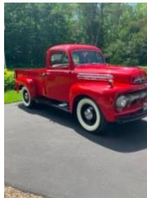
1951 Ford F-3 – High Bid $25,000 - Sold