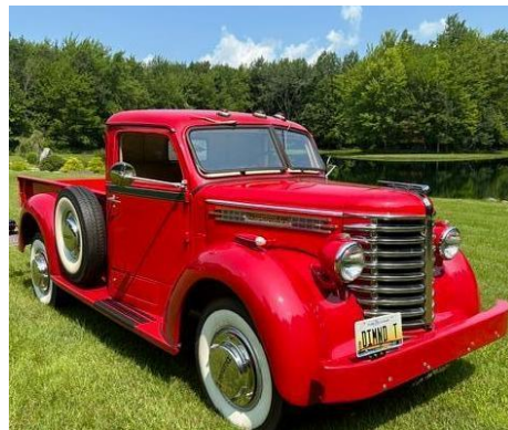
1949 Diamond T 201- High Bid $51,000 – Sold