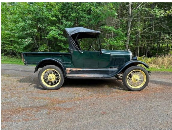
1927 Model A Roadster Pickup – High Bid $7,250 – Sold