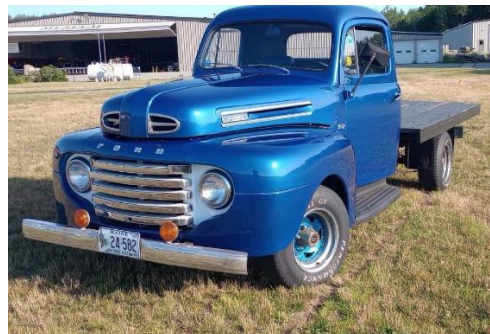
1949 Ford F-2 Flatbed – High Bid $5,250 – Sold