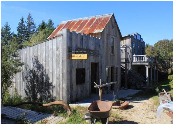
Frontier Town at Nervous Nellies