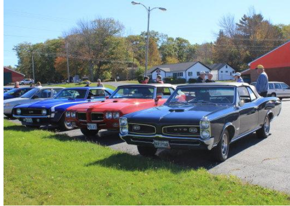
Met up with the Penquis Cruisers in Bucksport