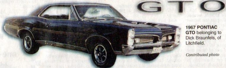
1967 PONTIAC GTO belonging to Dick Braunfels, of Litchfield.